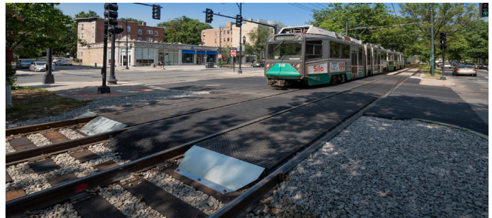
Rubber panel roadway crossing at Carlton Street (Completed January 2019)