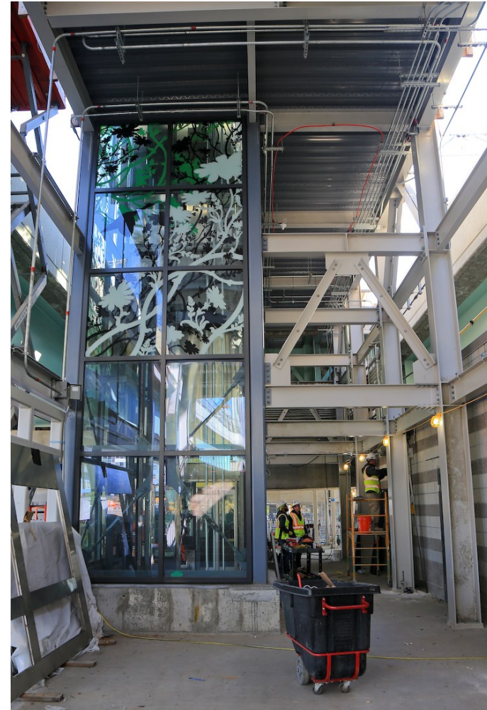
North Headhouse - November 2021