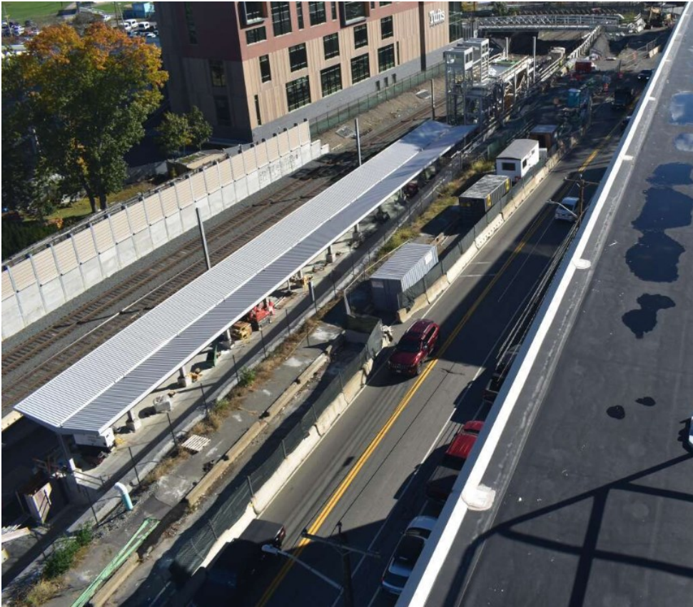
Station Platform - Fall 2021