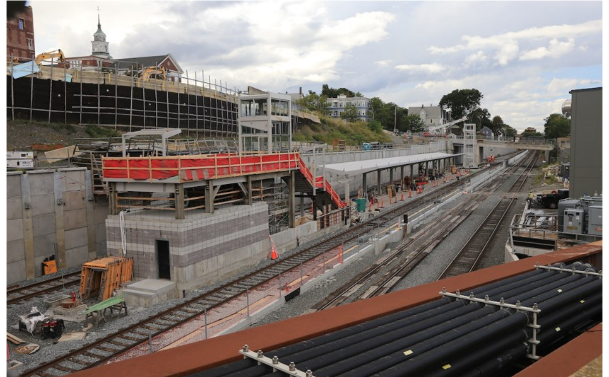
South Elevator Tower Fall 2021