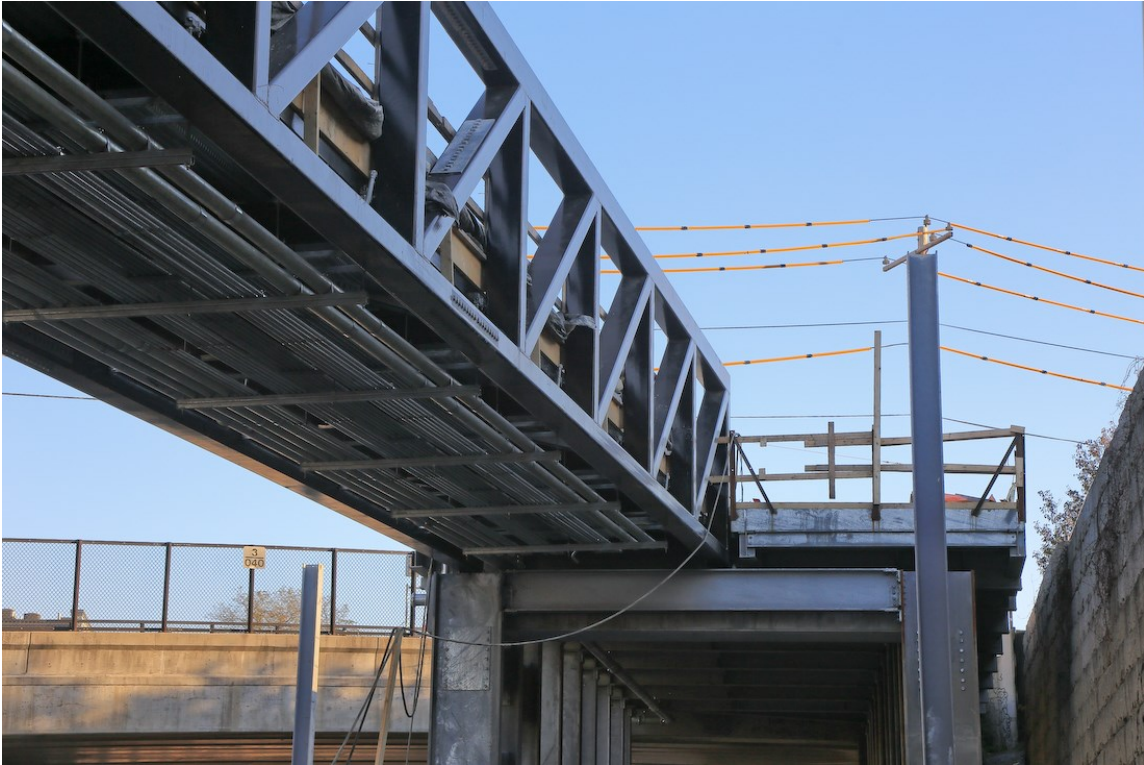
Pedestrian Bridge – November 2021