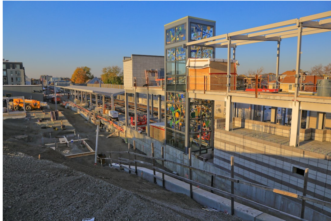
Broadway Entrance - Fall 2021