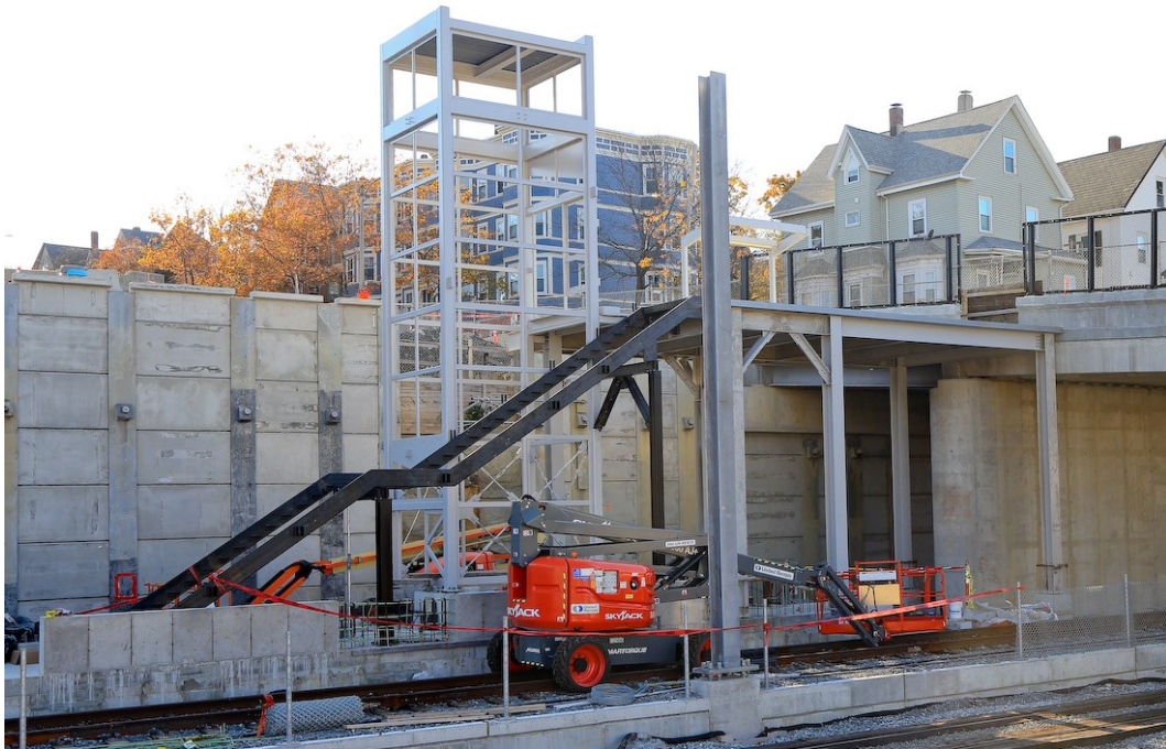
School St. Entrance – November 2021