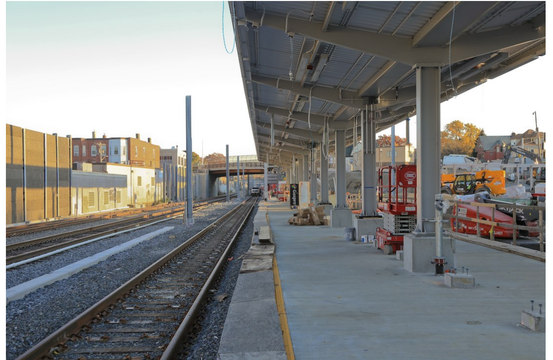
Platform level - Fall 2021