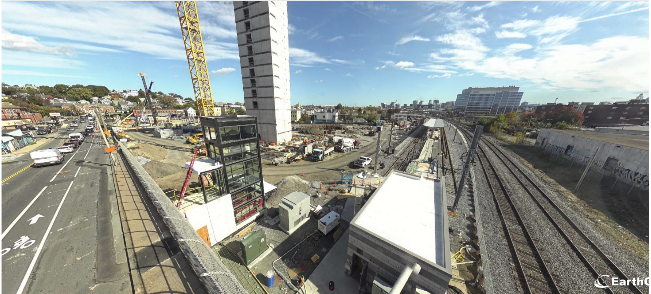
Elevator from Prospect Street Bridge designed and built by US2 – November 2021