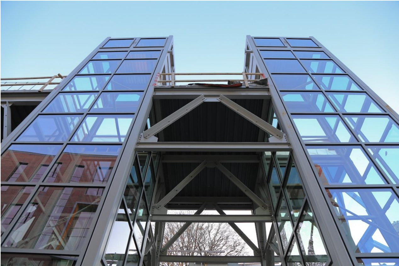
Elevator Shafts – November 2021