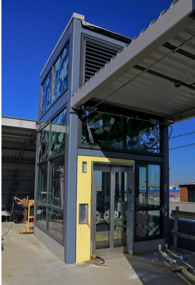
South Headhouse - November 2021