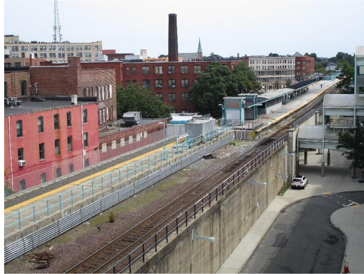
Overall Existing View - Lynn Station