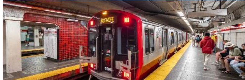
New Red Line vehicle providing service to riders at Park Station.