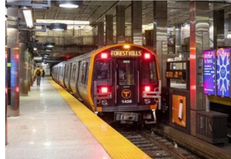
A new Orange Line train at North Station in 2021