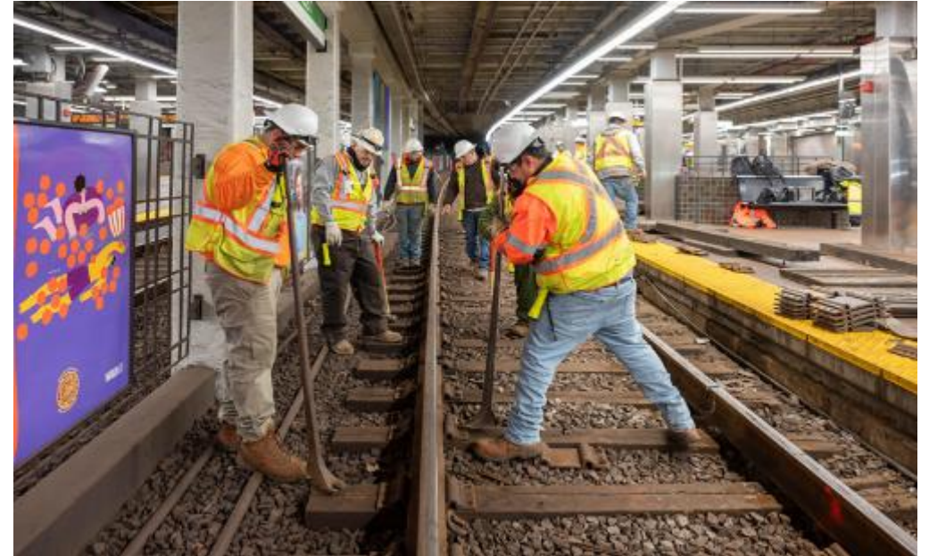
Green Line track work at Park St. Station during January 2024 TIP surge