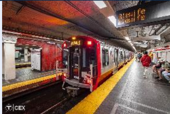
Track work between Alewife & Porter during Red Line surge