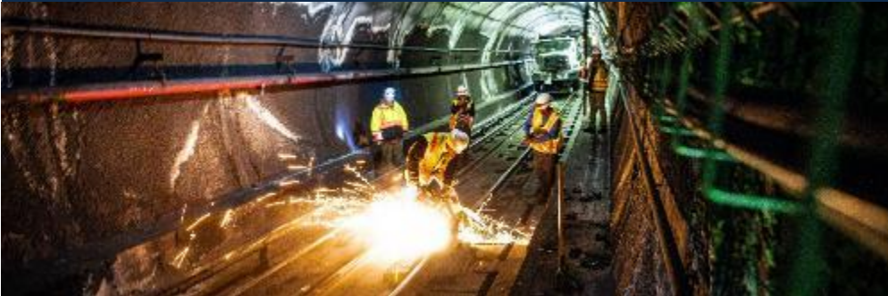
Track work during Red Line diversion as part of the Track Improvement Program.