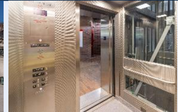
Entrance to Park Street Station