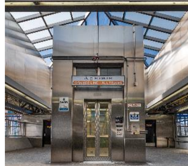
Elevator at Ruggles Station on the Orange Line