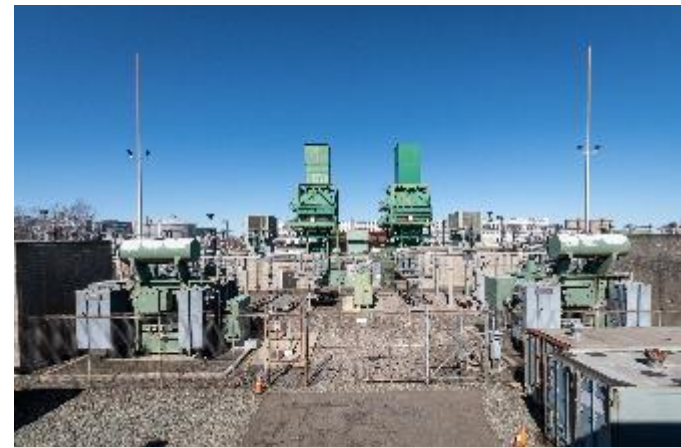
South Boston Power Plant