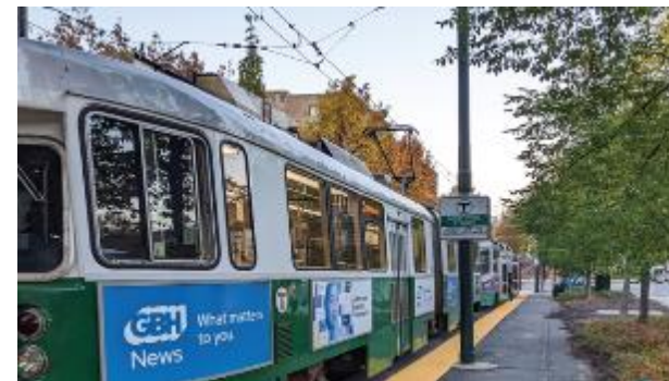
A Green Line train at Saint Paul Street station on the Green Line C Branch