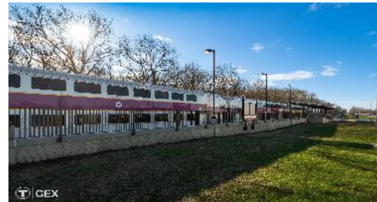
Commuter Rail Bi-Level Coaches