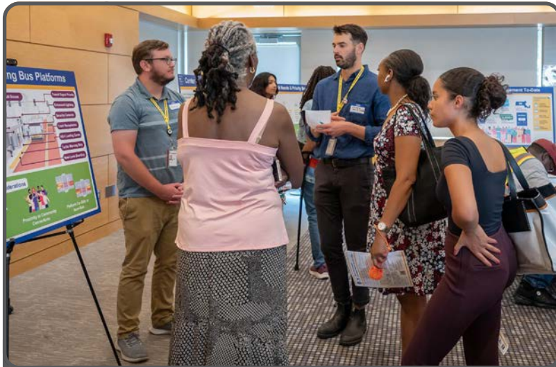
Participants at the Mattapan Open House in June 2024 shared their ideas and hopes for Blue Hill Avenue.

This proposed redesign aims to better connect community members with their neighborhoods and the rest of the city. A major component of the project is the introduction of center-running bus lanes along the corridor to greatly reduce transit delays, improve service reliability, and pave the way for more bus trips for 40,000 daily bus riders. This draft concept design includes between 9 and 11 pairs of bus boarding platforms to serve as bus stops. These locations were chosen because they provide riders access to key community