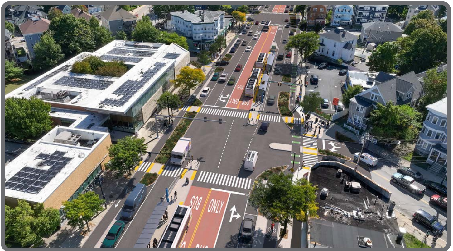
Rendering of the draft design of Blue Hill Avenue at Walk Hill Street, looking south.

Vui lòng truy cập mbta.com/BlueHillAve để xem thông tin này bằng tiếng Việt, tiếng Tây Ban Nha, tiếng Haiti Creole, tiếng Creole Cape Verde hoặc tiếng Bồ Đào Nha. Để yêu cầu dịch sang các ngôn ngữ khác, vui lòng liên hệ BetterBusProject@MBTA.com .